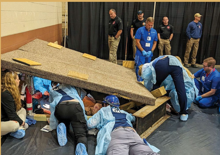
Attendees had an opportunity to practice hemorrhage control techniques while under a collapsed floor with Erlanger Trauma Services, Life Force, & Chattanooga Fire Department.

It was great to be back in person at Erlanger’s Trauma and Surgical Critical Care Symposium! Participants had an opportunity to learn and engage with subject matter specialists, explore the human body in the cadaver lab, and practice lifesaving hands-on skills with life like simulation aides. We are looking forward to next year’s event and hope to see you there!